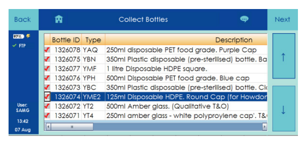
Collection Run showing bottle to be collected

For many years, companies that have been involved in water and wastewater sampling have identified a need for a solution to automate current manual/paper processes in the field, that would also integrate with LIMS. Water companies have to collect their water samples in a closely regulated environment. Sampling plans are held in LIMS (having been agreed and set up in advance to meet regulatory requirements) and these plans are used to generate a collection run for each sampler. The collection run defines where samples must be taken from, what sample bottles must be collected and what onsite tests have to be performed.